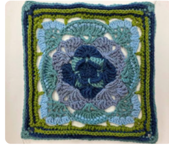
Completed block in Colorway 2

Round 14: With color A, begin with a standing hdc in any ch2 corner space, then (ch2, hdc) in same space. *Bphdc around next thirty-seven stitches, then (hdc, ch2, hdc) in ch2 space**. Repeat from * to ** three times, omitting final (hdc, ch2, hdc). Join with sl st to beginning hdc. (148 bphdc, 8 hdc, 4 ch1. 160 stitches in total )