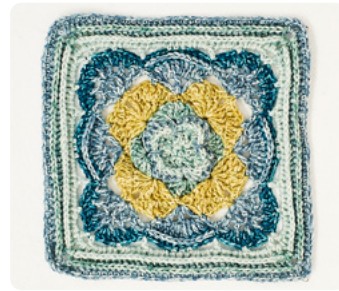
Completed block in Colorway 3