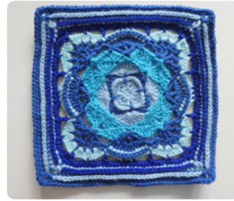
Completed block in Colorway 1

Round 14: With color A, begin with a standing hdc in any ch2 corner space, then (ch2, hdc) in same space. *Bphdc around next thirty-seven stitches, then (hdc, ch2, hdc) in ch2 space**. Repeat from * to ** three times, omitting final (hdc, ch2, hdc). Join with sl st to beginning hdc. (148 bphdc, 8 hdc, 4 ch1. 160 stitches in total )