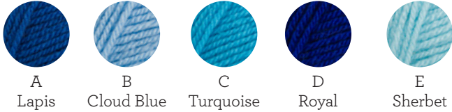
A Lapis B Cloud Blue C Turquoise D Royal E Sherbet

Special DK: 100g – 295m (322yds), 100% Premium Acrylic.